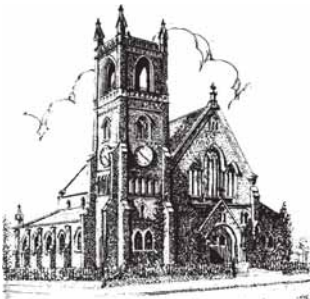
Founded in 1718

Time Dated Material -- Please Do Not Delay